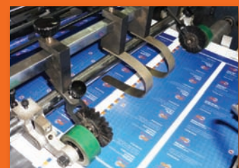
Headlay device for precise overlap control