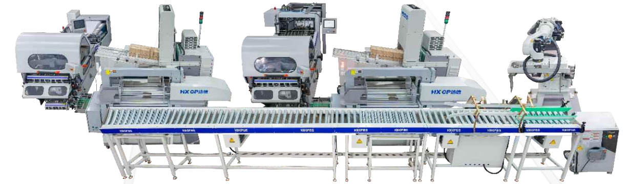
CP CP Intelligent Folding Line Reality View